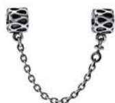
Protect your collection with a SAFETY CHAIN