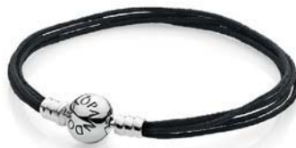
Multi-Strand Cord (M)