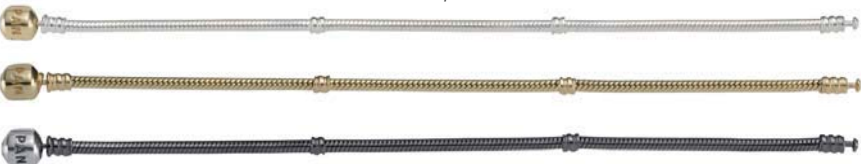
Barrel Clasp Bracelets

6.7 in 7.1 in 7.5 in 7.9 in 8.3 in 9.1 in 17 cm 18 cm 19 cm 20 cm 21 cm 23 cm