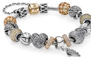
...to create your own CHARM BRACELET